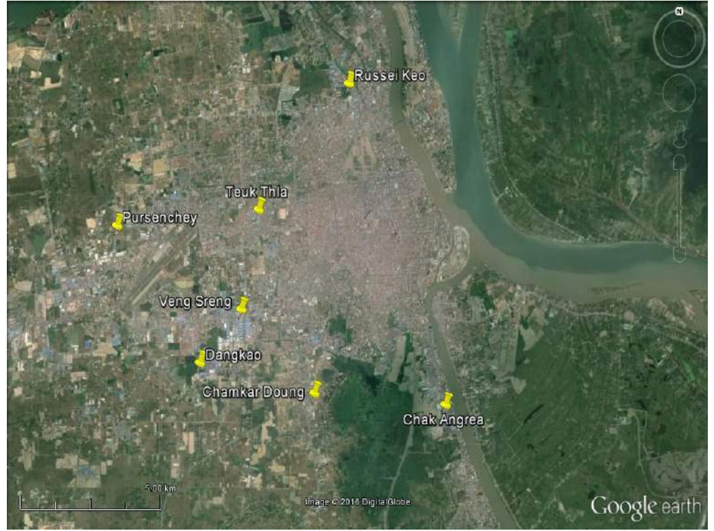
Figure 1. Qualitative interview locations

Map of Phnom Penh showing qualitative research locations. Locations were selected to be geographically dispersed in order to capture responses from women with a broad experience of different working and living conditions. There are no factories in the centre of town and most factories are located on the periphery of the city, where land prices are cheaper and there is better access to arterial roads for transport of goods. Factories are often clustered in groups around national roads, surrounded by high density 'rented room' [bantup juo] housing.