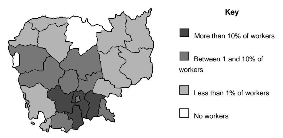
Figure 1. Home province of workers in the Cambodian garment industry

broader than this, encompassing workers from almost every province (22 of the 25 provinces; see Appendix 4 for further details). Given the concentration of factories in the traditional factory belt area surrounding Phnom Penh, and to a lesser extent on the coast close to the port of Sihanoukville, this underlines the importance of internal labour movement to the garment sector.