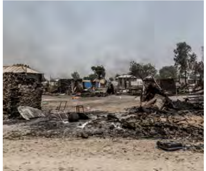
Destroyed homes burn in Malakal, Upper Nile State, February 2014.

Not all of these costs can be quantified, especially those in the last category. Hence the focus of the quantitative analysis is on the first two categories, with qualitative information on the third category used, where available, to supplement the discussion.