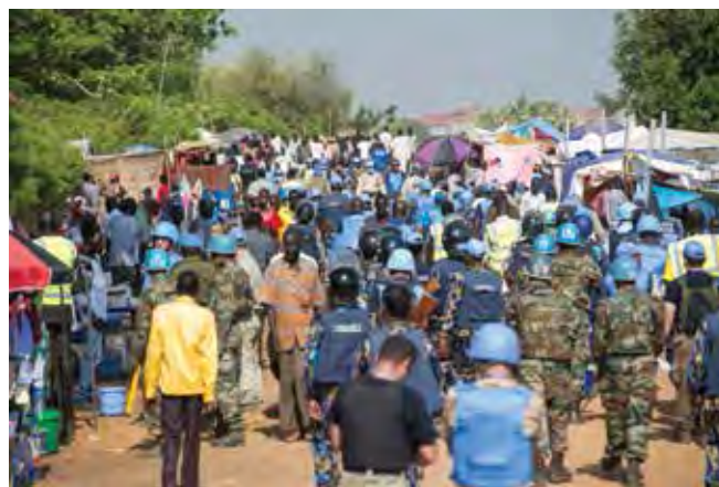
UNPOL enforces security measures at IDP camps in Juba. January 2014.

Finally, it needs to be emphasised that resource shocks exacerbate existing fragilities affecting prudent fiscal management. The government has recognised that poor fiscal discipline has led to an accumulation of domestic debt, including a large stock of domestic arrears that has yet to be precisely quantified. In his budget speech, the Minister of Finance acknowledged that defence requirements would be financed through borrowings from the China National Petroleum Corporation against future oil earnings 41 . He also stated planned contributions to the Oil Revenue Stabilisation Fund and the Future Generations Fund, which under the terms of the Petroleum Management Act were to account for 25% of gross oil earnings, would be deferred in order to release funds for current needs. 42 These developments further illustrate how conflict diverts resources to less socially productive uses and undermines improvements to economic governance.