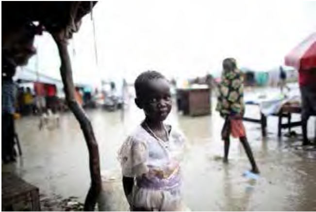
Protection of Civilians site at the UNMISS base in Bentiu, Unity state, July 2014.

As can be seen from the figures above, the overall cost of conflict in South Sudan to the neighbouring region 32 is approximately 32.3% of the region's total annual GDP under the 'high conflict scenario 2'. The potential consequences are particularly great for Kenya and Uganda, who are South Sudan's biggest trading partners.