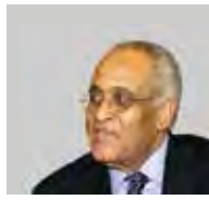
Dr. Salim Ahmed Salim

Former Minister of Foreign Affairs, Minister of Defence, Prime Minister of the United Republic of Tanzania and Secretary General of the Organisation of African Unity.