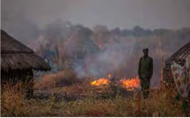
A "Nuer White Army" fighter stands in a burning field near Akobo, Jonglei State, February 2014.