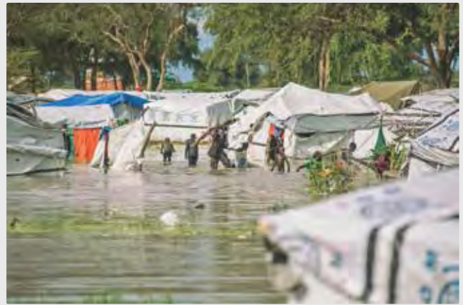
UN Peacekeepers help move families from a flooded "Protection of Civilians (PoC)" site to a new site at the UNMISS base in Bor. October 2014.

7.2 The National Unity Government will need to work with the financial and technical support of the international community to lay strong foundations for a new South Sudan that is stable, democratic and prosperous.