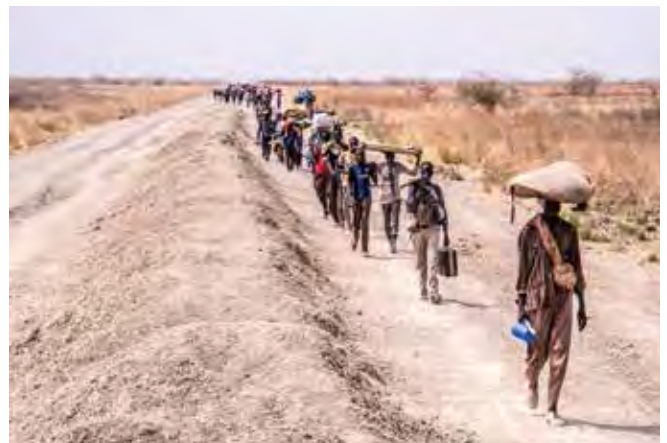
An armed group carries away looted goods from Malakal, Upper Nile State, February 2014.

It is as yet unclear what position the Kenyan authorities propose to adopt in regard to the situation in South Sudan. The commercial and security interests cited above suggest that Kenya has a strong interest in securing peace and stability. Assuming this to be the case, the figures reported for Somalia can be interpreted as a guide to how much a prolonged intervention may cost if the conflict in South Sudan were allowed to escalate significantly. We project that under the medium and high conflict scenarios, Kenya would incur an extra US$ 200 million in military expenditures.