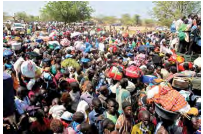
Civilians fleeing the fighting and seeking refuge, wait outside a compound of the UN Mission in Bor (December 2013).

In the following sections, we explain the methodology we use to relate the baseline and conflict scenarios, respectively, to each of the three cost categories identified.