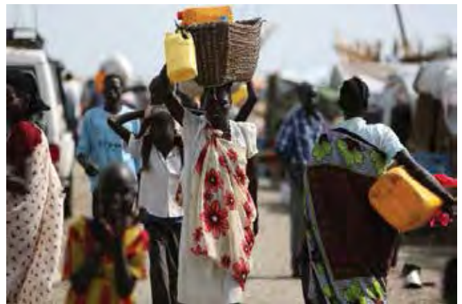
Protection of Civilians site at the UNMISS base in Bentiu, Unity state, July 2014.

Another key issue not dealt with in the analysis presented is the social cost of the conflict for this young nation, just emerging from nearly two decades of brutal war with Sudan. The political violence unleashed in December 2013 has been especially damaging because it has targeted the most vulnerable groups: women, children, the elderly and disabled. The pervasive use of sexual and gender-based violence against women and girls is one manifestation of the unravelling of social norms and values that has characterized this conflict. Others include the weakening of traditional social safety nets, the adverse impact on people's sense of dignity and pride, and the palpable sense of mistrust amongst people who only months ago were neighbours. They indicate that South Sudan will need ongoing support and assistance from its neighbours and the international community to develop ways of reconnecting people with their sense of belonging in society. This reconnecting needs to happen at the individual level, but it is also critical to ensure the country as a whole can undergo the kind of social, psychological and economic transformation necessary to achieve lasting peace and reconciliation.