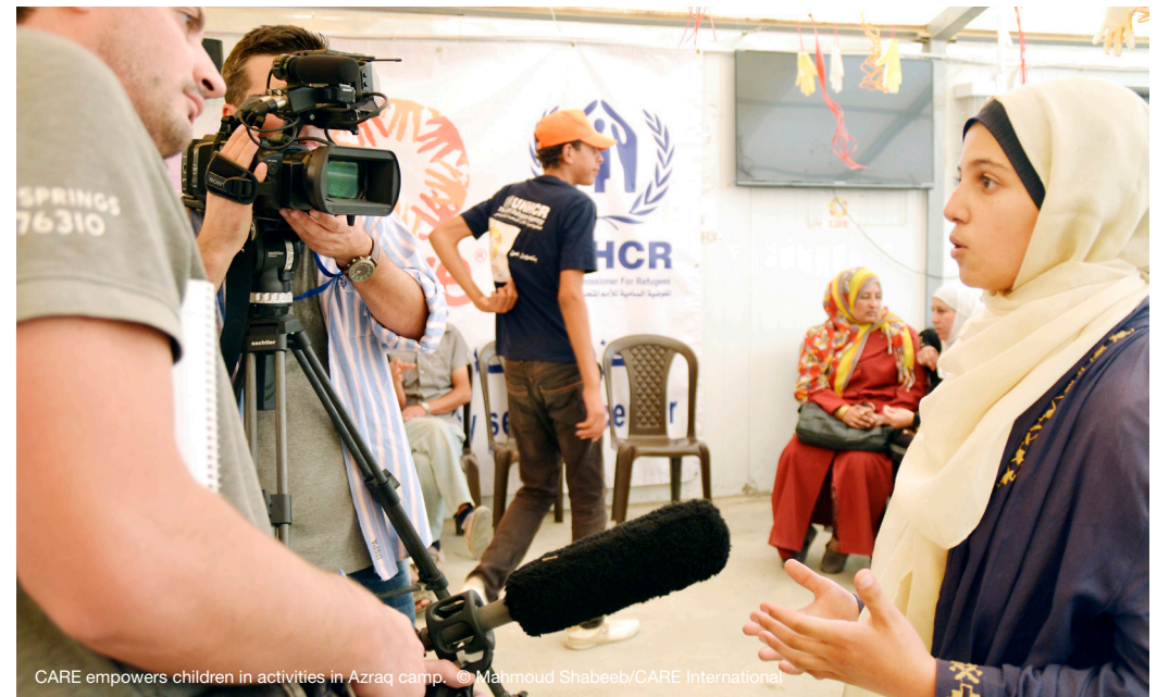
CARE empowers children in activities in Azraq camp.