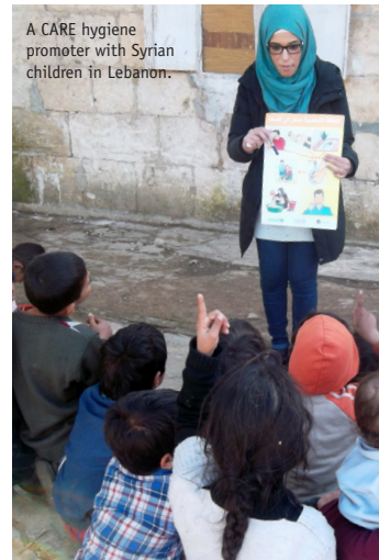
A CARE hygiene promoter with Syrian children in Lebanon.

In Aleppo, Syria, 50 percent of boys and girls are working up to 12 hours a day.