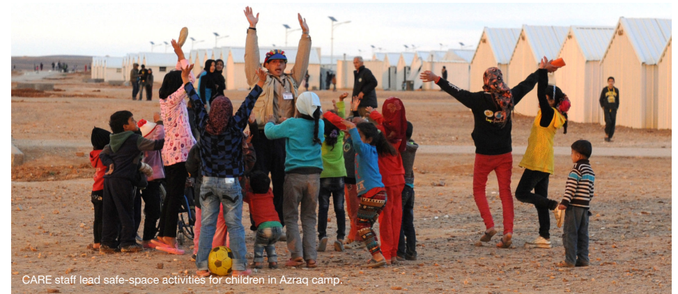
CARE staff lead safe-space activities for children in Azraq camp.