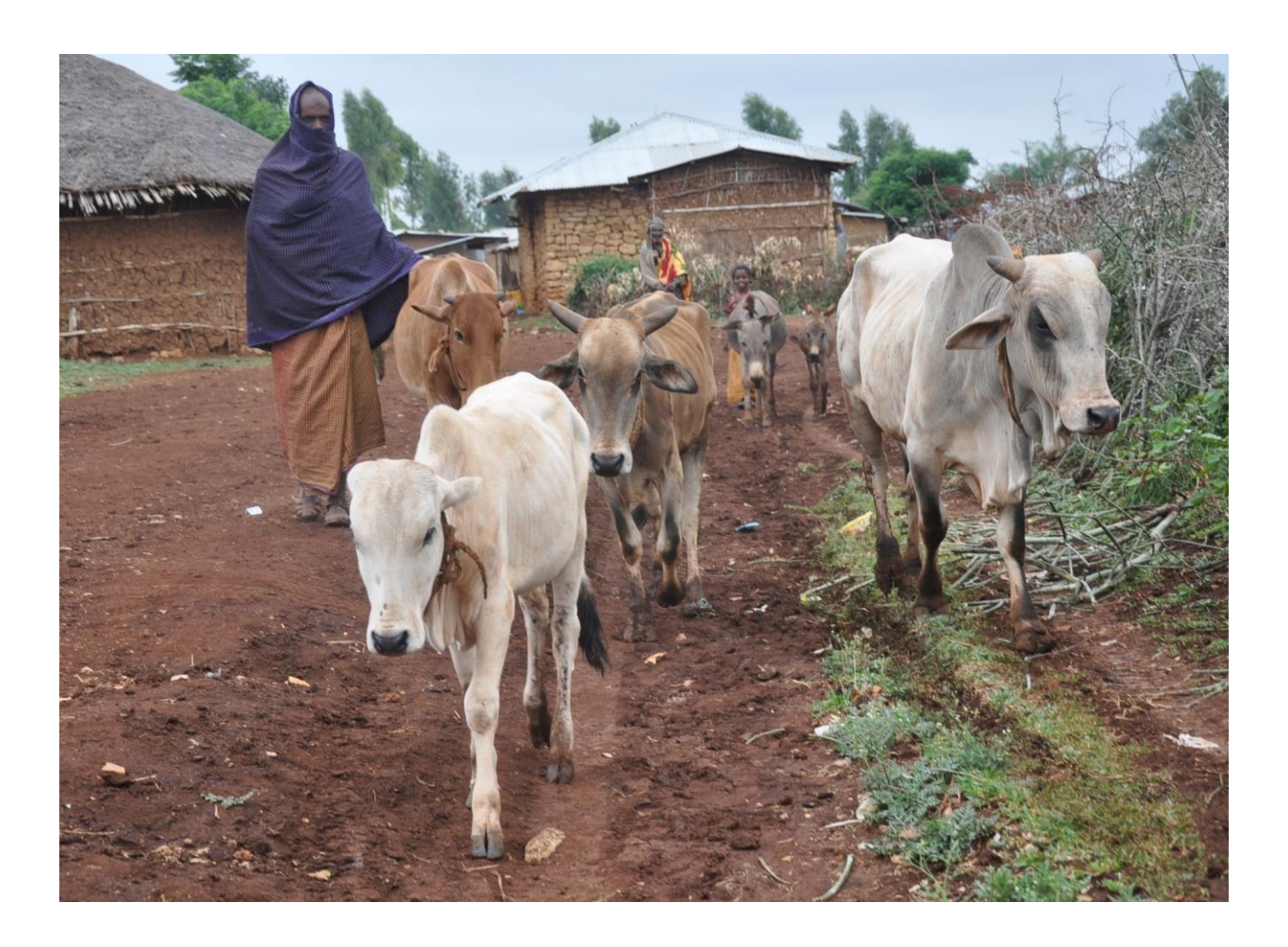
Caption: In West Hararghe, Ethiopia, erratic and insufficient rains damaged families' crops and livelihoods. Unofficial government sources disclosed that likely 150,000 people were in need of food supplies. Recurring terrible droughts since 2011 force animals to migrate to other parts of the country.