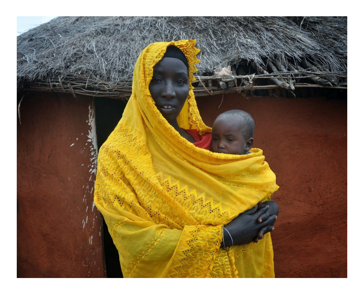
Caption: A mother carrying her child in West Hararghe, Ethiopia, where tens of thousands of people face food insecurity due to recurring droughts. Unstable weather conditions since 2011 especially challenge pregnant and lactating women who fear that they can't provide enough food for their children.