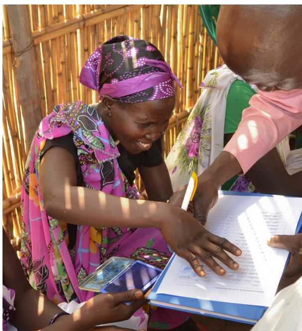
A woman in Nagdiar Payam, Baiet, Upper Nile State uses a thumbprint to register her participation in CARE workshop on the importance of local participation to the development of good governance.

Conflict does not simply generate heightened levels of GBV in a vacuum; rather, conflict can draw upon and expose underlying prejudice and gender discrimination. The following section examines the context of GBV in South Sudan.